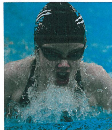
Top: Corby's new 50m pool was converted to short-course format for the junior league final